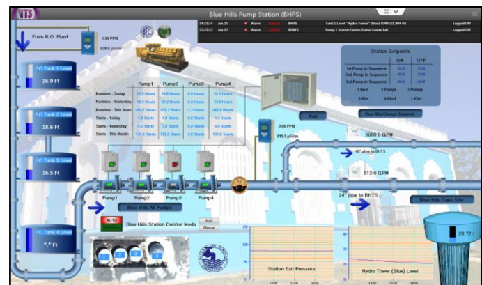
Pump Station Display Created by Star Controls within VTScada