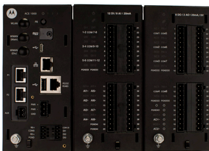
ACE1000 Remote Terminal Unit without cover