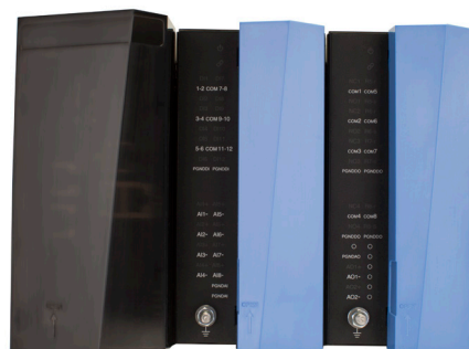
ACE1000 Remote Terminal Unit with covers